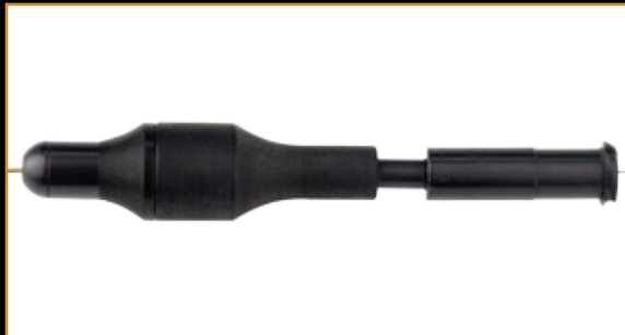
Simultaneously “push and twist” with the Control Point™ handle

The first and only extendable tip support catheter. Rapid, routine lesion crossing “on-the-fly”