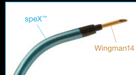
Use with Wingman14